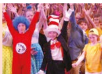
Seussical the Musical wows crowds! See page 18