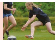
Scotland call-up for High School sports star See page 24